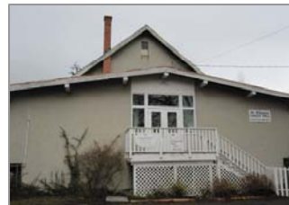
St. Alban's Church Hall