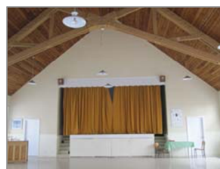
Large Assembly-Dance School