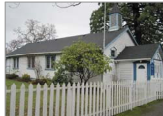
Arbutus Christian Building