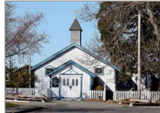
Arbutus Christian Fellowship