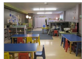
Lansdowne Preschool Premises