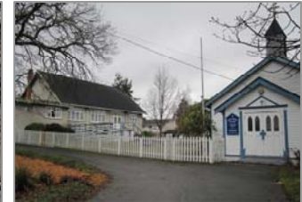
Entrance to Subject Property