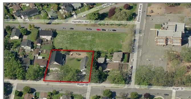
Bird's Eye View of Subject Property

It is anticipated that all offers will require a minimum acceptance period of two weeks for the Sellers review and consideration.