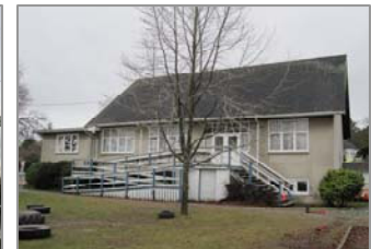
Lot A - St. Alban's Hall