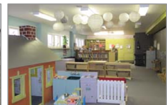
Lower Level - St. Alban's Hall